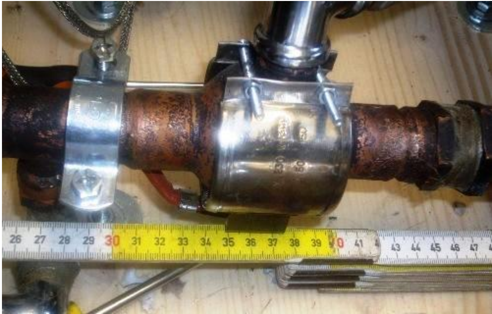
Figure 3 shows the central fuel container between the 35 and 40 cm marks on the ruler. It is about 50 \text{ cm}^3 in volume. (Photo: Giuseppe Levi).