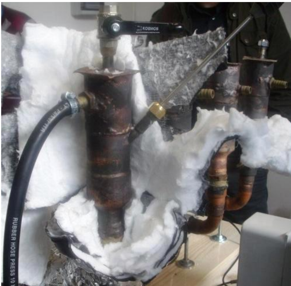
Figure 4 showing the chimney with the black outlet tubing, the thermocouple holder and on the top, the steam exhaust valve. (Photo: Giuseppe Levi).